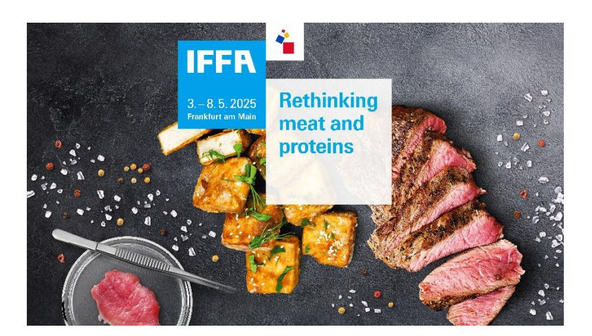
The new key visual for IFFA shows the entire spectrum of proteins

quo on the topic of new proteins. One hall level above, in Hall 11.1, suppliers of ingredients, spices, additives and casings will present their innovations.