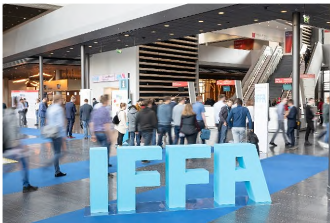
IFFA welcomes trade visitors from all over the world in Frankfurt am Main from May 14 to 19, 2022.

One of the biggest food industry segments will meet from 14 to 19 May at the leading international trade fair IFFA – Technology for Meat and Alternative Proteins – in Frankfurt am Main. For six days, the focus will be on the safe and sustainable supply of healthy proteins – be it meat or plant-based protein – to a growing world population. 860 exhibitors from 44 countries will present their innovations from the last three years: Technology for processing and packaging, ingredients as well as innovations for sales. The traditionally high internationality of IFFA will also be achieved this year: 58 percent of the companies come from abroad. Strongly represented, after the German companies, are exhibitors from Spain, Italy, the Netherlands, Poland, France, Denmark and the USA.