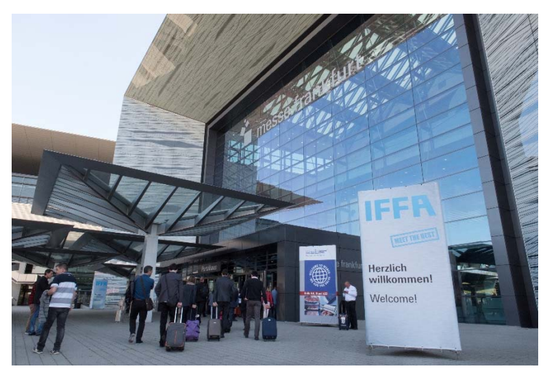
Frankfurt Fair and Exhibition Centre, Portalhaus entrance.

More than 1,000 companies from around 50 countries, including all market leaders, are set to present innovations and future-oriented trends for the entire processing chain of the meat industry at IFFA from 4 to 9 May 2019. IFFA is a must for manufacturers of machines and equipment for processing and packaging meat and meat products. The timing of the fair and the exhibitors' innovation rhythm go hand in hand with many products being launched onto the world market at IFFA. Altogether, trade visitors to the fair come to Frankfurt from around 140 different countries. The overview of developments throughout the entire sector helps butchers and the meat-processing industry make their investment decisions for new technologies and reveals new concepts and strategies for the future of their own companies.